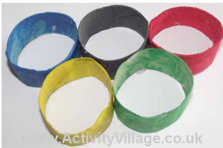
This is what your cardboard tube Olympic rings should look like!